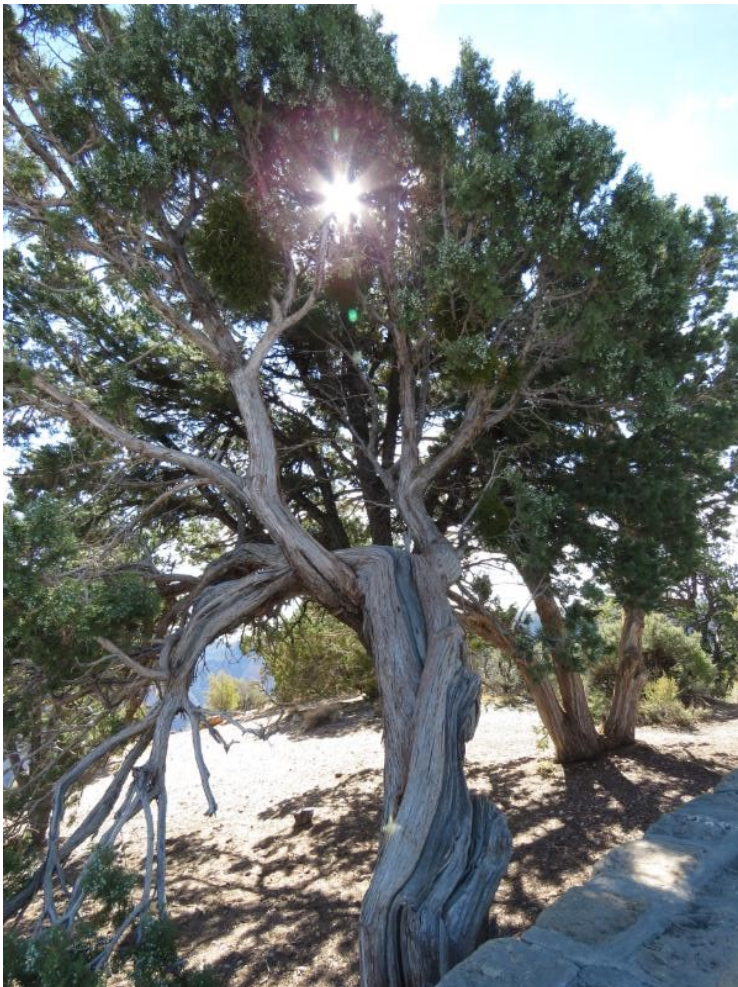
A juniper tree on the South Rim of the Grand Canyon in Arizona