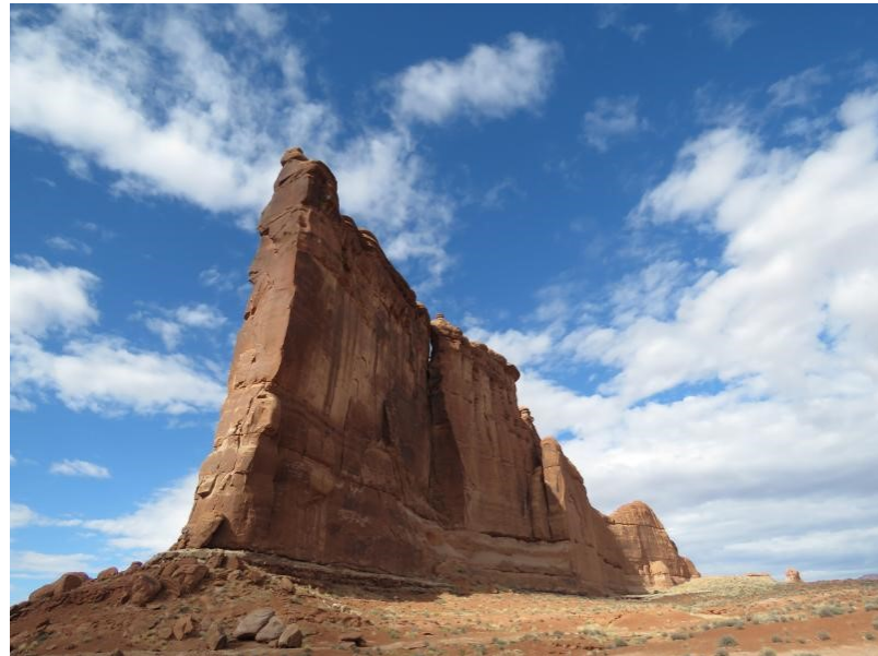
Tower of Babel rock formation in Arches National Park, Utah