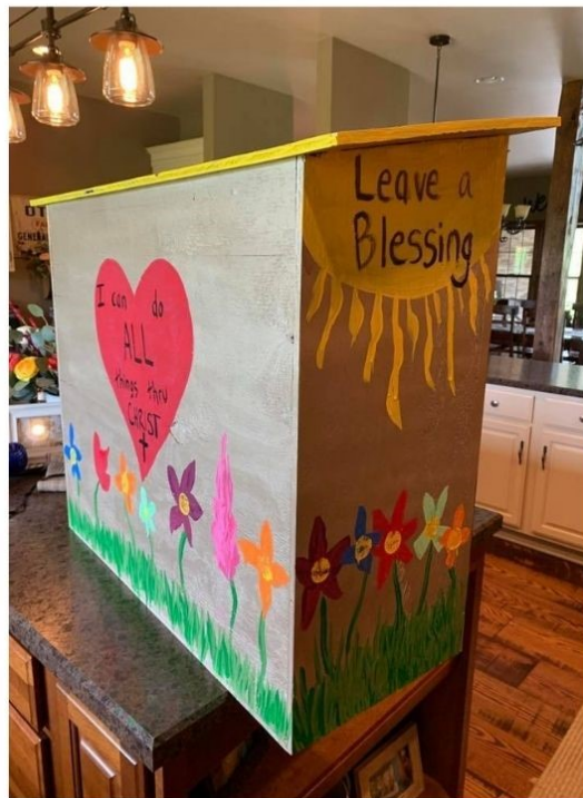
Youth Blessing Box Spring 2020