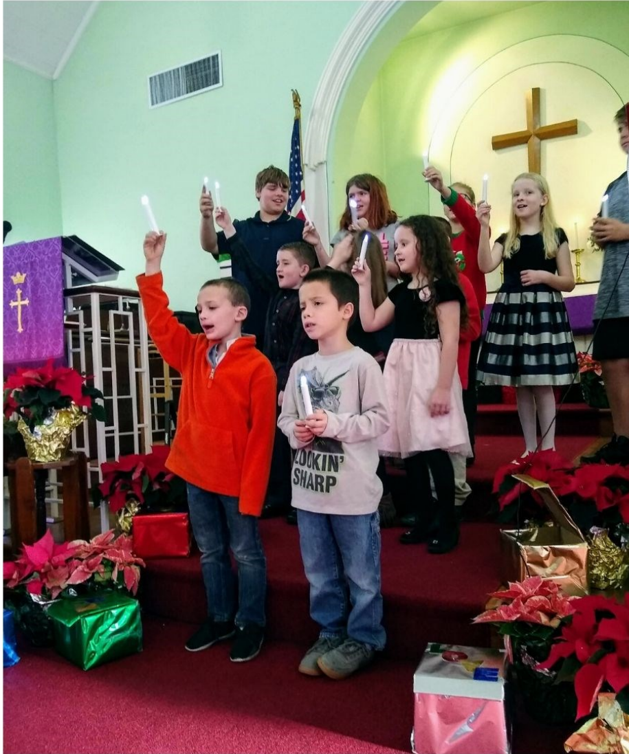
Youth perform "Light the Candles All Around the World" at Trinity's Christmas Program