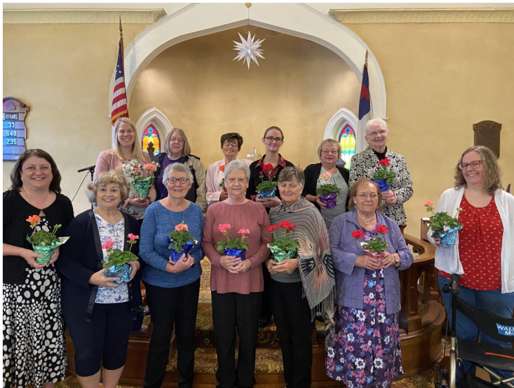
Mother's Day 2024 at St. Paul's.